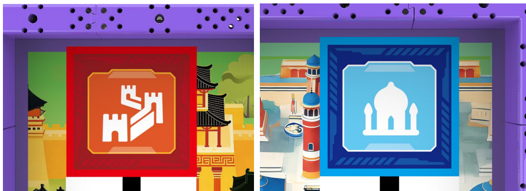
Figure 3. Placement Zones