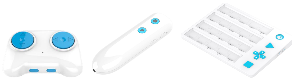
Figure 7. Illustration of Remote Controller and Programmer

Robots must be controlled using handheld remote controllers, coding pens, or programming boards. Mobile devices such as phones, iPads, or tablets are not allowed, as shown in Figure 7.