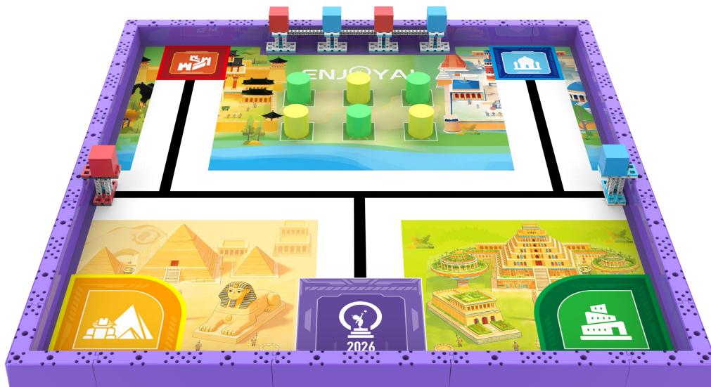
Fig.1 Competition field

The competition field measures 120 × 120 cm (see Figure 1) and is made of PU fabric or printed fabric. The robot base area measures 25 × 25 cm.