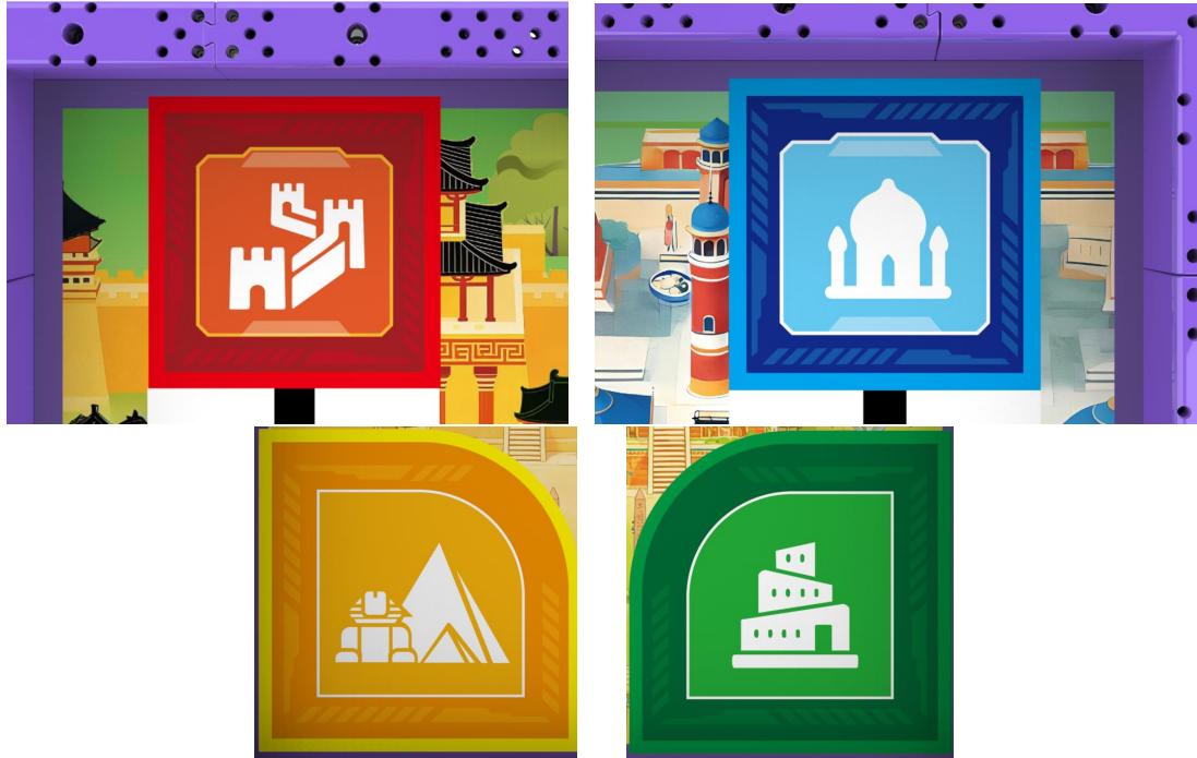
Figure 5. Placement Zones